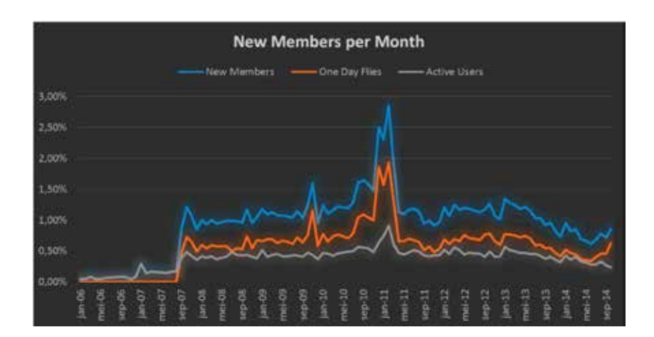
Fig. 13.1: New members of Forum X over time.

information that seemed most valuable at first, only to find ourselves at a dead end after about a week. The medical information could be of value only if we could connect it to specific behaviour on the forum itself. Since we gathered only profiles, and not the conversations in the fora and topics sections of the discussion board, we considered this direction of study to be a dead end. In the following few days, two dates quickly became important in our research: the date the profiles were created and the date a profile was last active. We could measure the forum's growth over time by adding up all the dates of profile creation (see Figure 13.1).